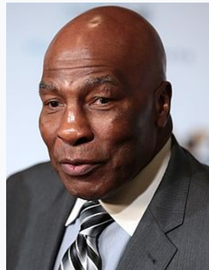
Shavers in 2017