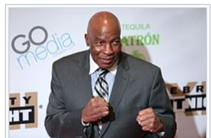
Shavers at Celebrity Fight Night in Phoenix , 2017

Shavers was a heavy-handed puncher who stalked his opponents, setting them up for his thunderous right, which was responsible for many of his knockouts. Although Angelo Dundee in a Sports Illustrated mid-1970s article explained "He can get you out of there with any kind of shot," basically meaning left hook, right cross or right uppercut. Several famous tough chins had fallen to each of those punches. Bugner and Ellis to the uppercut.